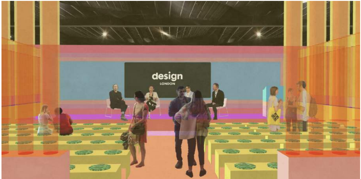
'Transparency in shades of colour' by Yinka Ilori

An essential platform for those looking to network and source the latest and most innovative furniture, lighting and design pieces during the annual festival, the four-day event boasts a jam-packed programme of engaging content and a highly curated selection of sought-after design brands from around the globe.