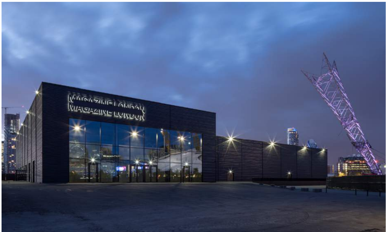
Design London at Magazine London, North Greenwich

Excitement is building around the reopening of events and Design London is gearing up to welcome the architecture and design community to London's new favourite neighbourhood, North Greenwich, for its inaugural event.